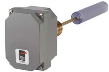
F263 Liquid Level Float Switch